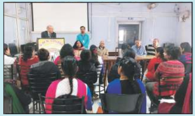
Faculty Development Programme by Dept. of Computer Sc. & App.