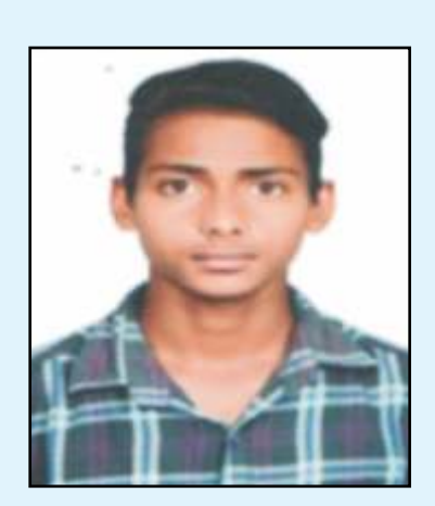
Princepal Best Gymnast in All India Inter-Varsity C'ship