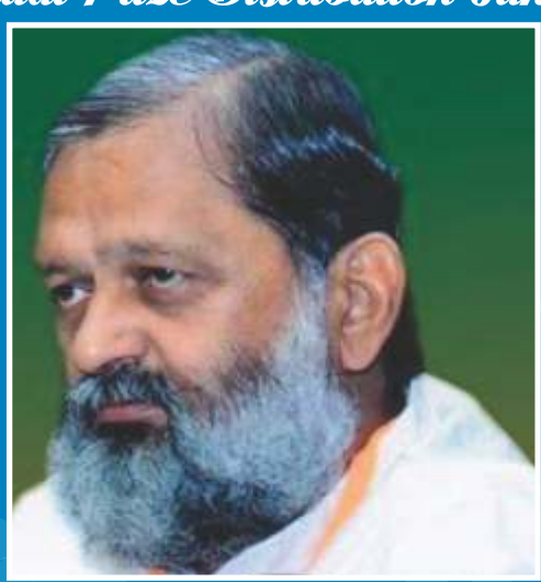
Sh. Anil Vij Hon'ble Minister of Health, Medical Education & Research, AYUSH Science & Technology, Sports and Youth Affairs and Archives