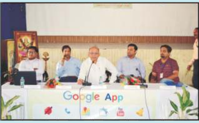
Google Workshop by Department. of Computer Sc. & App.