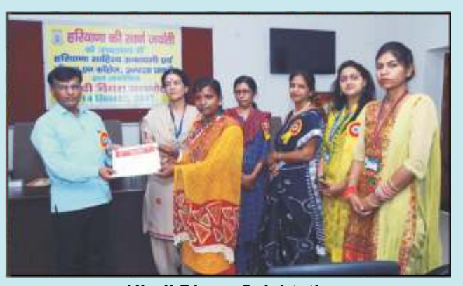
Hindi Diwas Celebtation