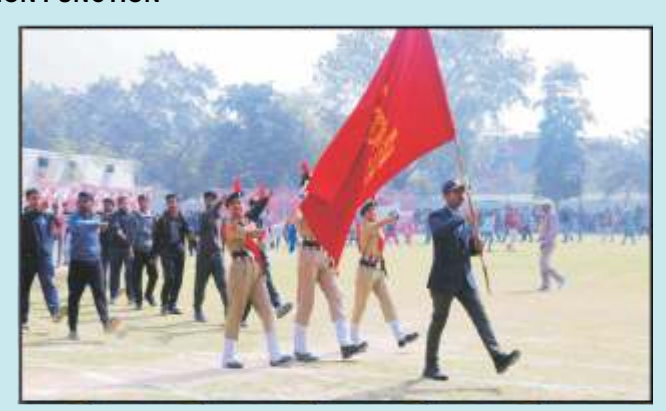
ANNUAL ATHLETIC MEET