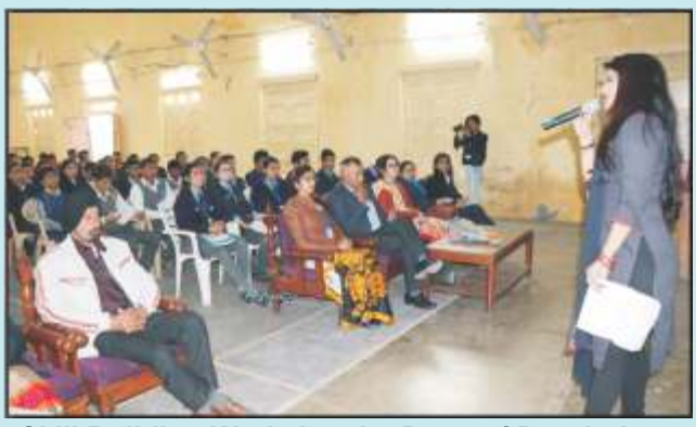
Skill Building Workshop by Dept. of Pscyhology