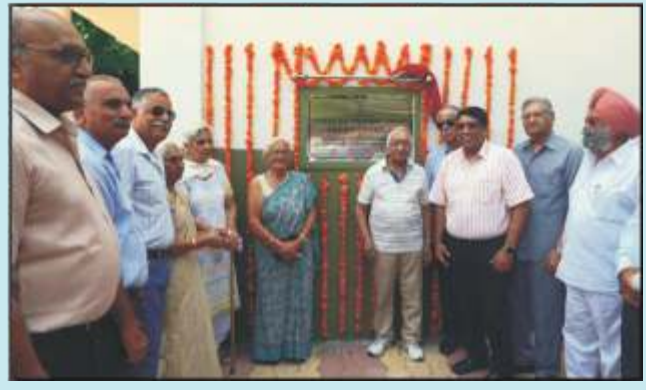
INAUGURATION OF JASWANT RAI MEMORIAL LIBRARY