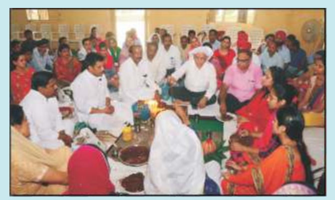
Auspicious Start of the Session