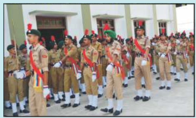
NCC Cadets in action